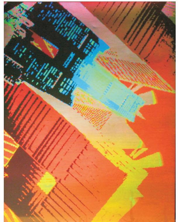
30 x 40 cm dot-matrix hologram pixel size 1 x 1 mm pictures courtesy of the Kun Shan University, Taiwan